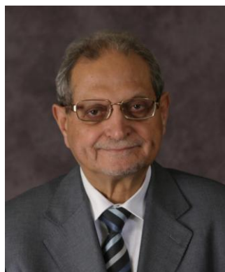
Abdul Salam Al-Abbadi Minister of Awqaf and Islamic Affairs Country: JORDAN dr.abdessalem.abadi@gmail.com