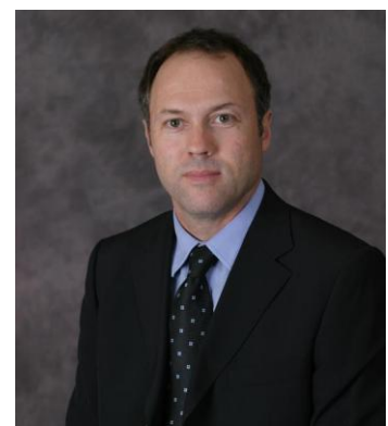
Roberto Arriada Lorea

Doctor, Former Government Minister, Author of Constitution Country: BANGLADESH