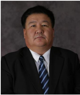
Enkhjargal Oyunbadam Member of Religious Issues Council, Office of the President of Mongolia Country: MONGOLIA