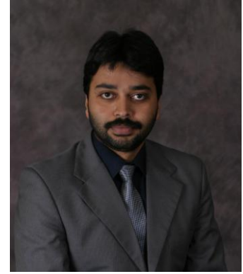
Athar Hassan Gorchani

Doctor and Former Senator Country: PHILIPPINES