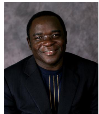
Matthew Hussan Kukah Reverend Father, Vicar General Kaduna Catholic Archdiocese Country: NIGERIA