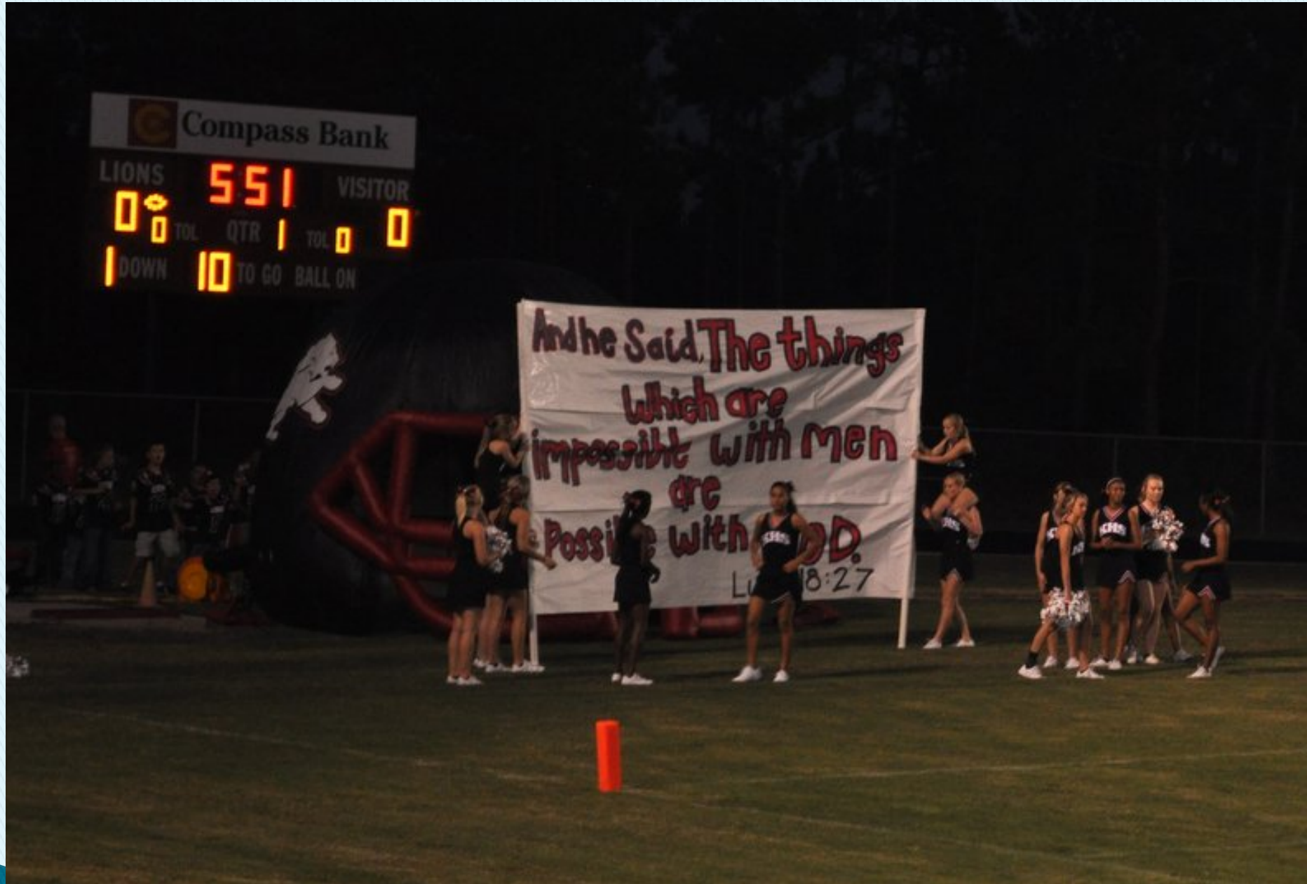
Kountze, TX, cheerleaders hold prayer banner for football team to run through.